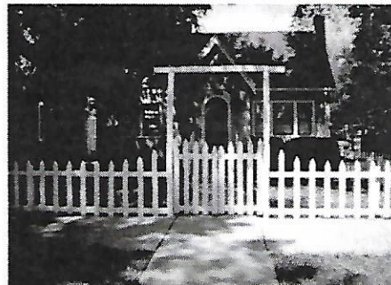
Charming vintage cottage