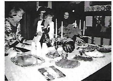
Morning Garden Club members enjoying their Christmas party

Follow us on facebook! Historical Society for SE New Mexico and visit us on line www.roswellnmhistory.org