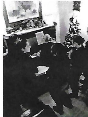
Ladies of NM Youth Challenge