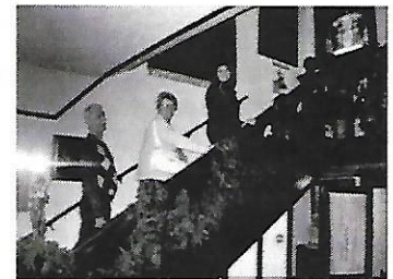
Visitors on parade at the Christmas Open House